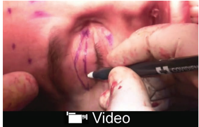
Video graphic 1. See video, Supplemental Digital Content 1, which displays a simplified lateral brow lift markings. This video is available in the "Related Videos" section of the Full-Text article on PRSGlobalOpen.com or available at http://links.lww.com/PRSGO/B96 .

see video, Supplemental Digital Content 1, which displays a simplified lateral brow lift markings, http://links.lww.com/PRSGO/B96 ).